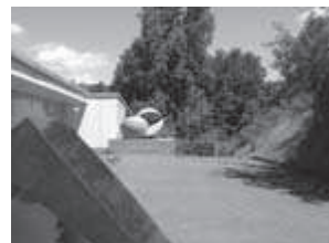
3. Studio-House in Zumikon (1967-68), Entrance façade.