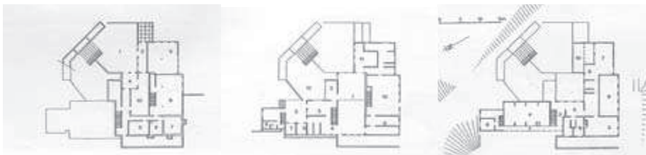
4. Studio-House in Zumikon (1967-68). Plan. In: Gimmi, Karin, 2G 29/30 Max Bill Architect , 210. © Max Bill, ProLitteris / SPA, 2013.

The house is situated in the green suburban area of Zumikon in Zurich where it looks down a hillside to the West and South. Bill's strategy was once more to design a house to suit the existing topographical contours, employing here an L-shaped plan that faces the rear of the site where it embraces a garden and a view of the sloped surrounding landscape. The topography led him to distribute his design among three levels including a ground floor, an entrance floor above and a lower floor (basement) (fig.4). The entrance is set in a low, elongated volume which, approaching from the driveway, is slowly revealed among the trees with a somewhat industrial aesthetic of hard lines and seamed white industrially produced panels. While the three storey structure is almost completely hidden at the entrance, in the terraced garden at the back one is able to comprehend the multi-level arrangement from a lower elevation.