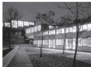
2. Hochschule für Gestaltung (HfG), 1950-55. In: Gimmi, Karin, 2G 29/30 Max Bill Architect , 112. © Max Bill, ProLitteris / SPA, 2013